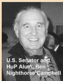
U.S. Senator and HuP Alum, Ben Nighthorse Campbell

Senator Ben Nighthorse Campbell (BS '58) chose not to seek a third term in the Senate. According to a recent article in Washington Square , Campbell said, "it was time to return to my ranch and family." Campbell has also battled some health issues over the last few years that may also have contributed to his decision. Campbell was a one-time Olympic Judo athlete and was active with the Spartan Judo team while at SJSU.