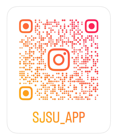
Follow us on Instagram!

If you are not interested in receiving these SJSU EAP Newsletters please unsubscribe Here.