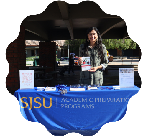
UCSC Cal-SOAP Higher Ed Week Tabling Event at Yerba Buena High School

EAP is happy to present to families, guardians, and parents!