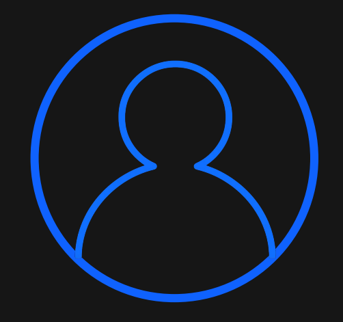
App Developer/ Architect