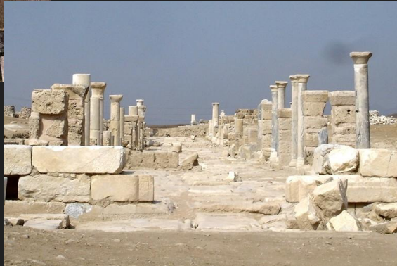
church of Colossians