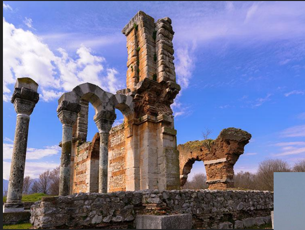
Church of Philippians