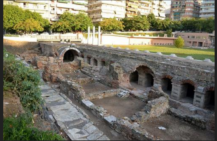
church of Thessalonians