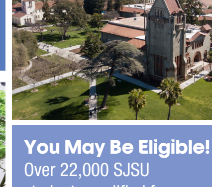
You May Be Eligible Over 22,000 SJSU students qualified for financial aid during the '21-'22 academic year.