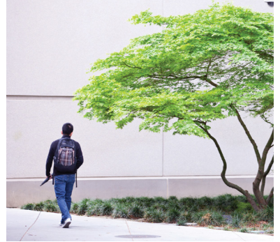
Did You Know? SJSU disbursed over $138.8M in Federal Aid for the '21-'22 academic year.