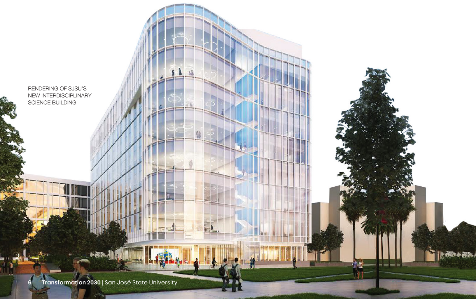
RENDERING OF SJSU’S NEW INTERDISCIPLINARY SCIENCE BUILDING

Teaching, research and laboratory spaces facilitate interdisciplinary projects inside and outside of the classroom, connecting faculty members and students across diverse areas of study, and fostering industry